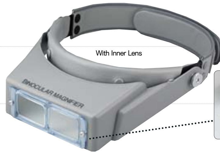
With Inner Lens

※ The work distance gap depends on the person using the product.