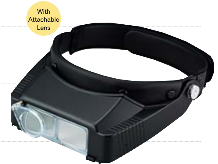
With Attachable Lens