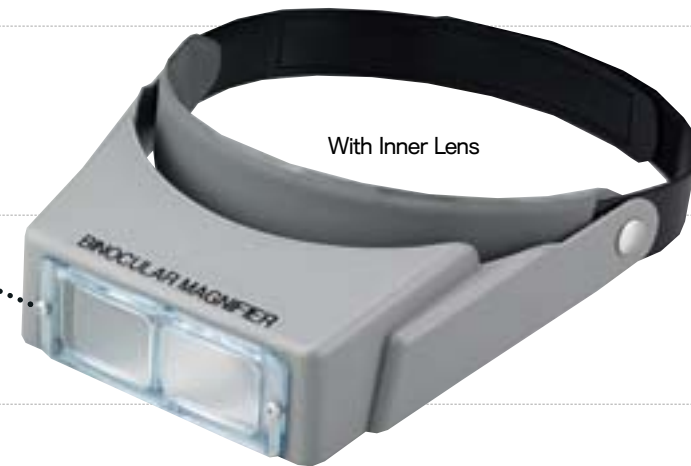
With Inner Lens